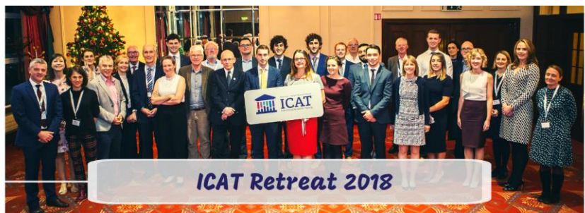
ICAT Retreat 2018